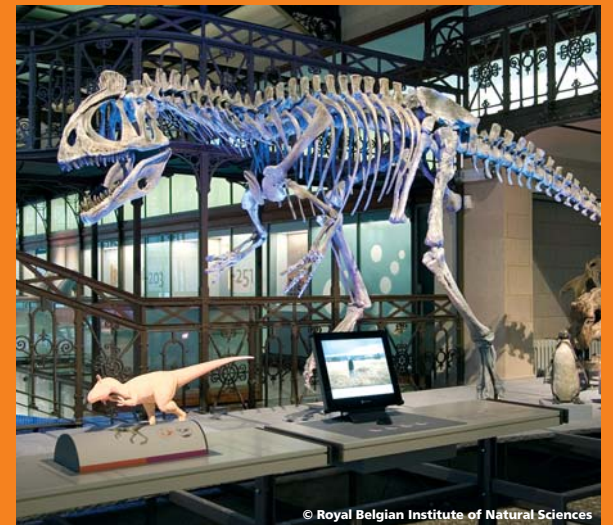
© Royal Belgian Institute of Natural Sciences